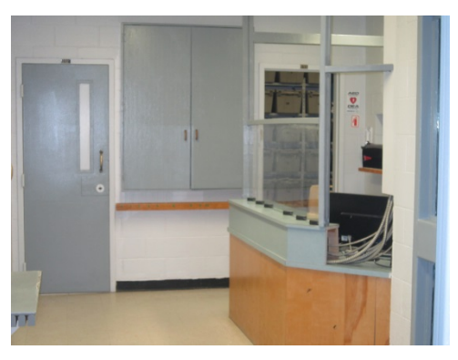
Exhibit 3.11 - Admissions area and holding cell at SJRCC