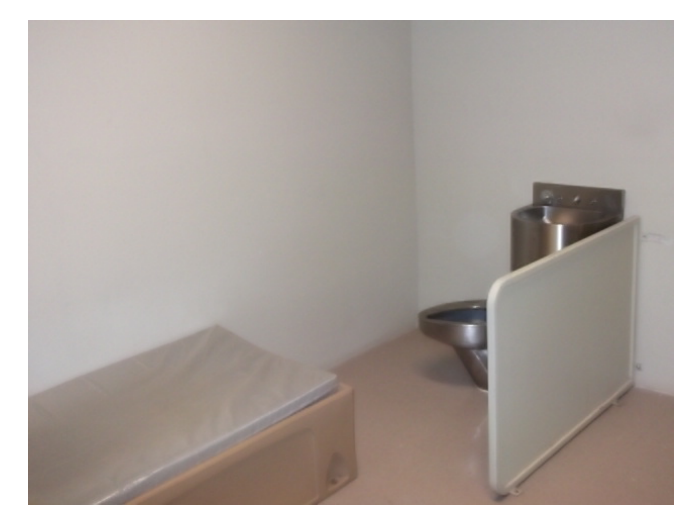
Exhibit 3.12 - Medical isolation cell at Miramichi Women's Correctional Centre