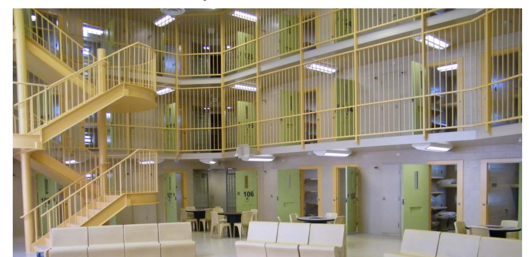
Exhibit 3.6 - Inside a General Population Unit at SRCC- Shediac, NB

546 inmates (See Appendix IV for the location of New Brunswick's correctional institutions). The Department of Justice and Public Safety reported just over 3,600 custodial admissions in 2015-2016 fiscal year. The average sentence (period in custody) in New Brunswick is 76 days.