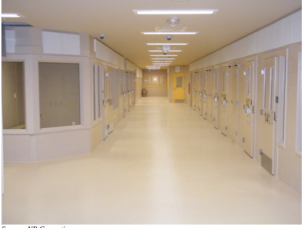
Exhibit 3.10 - Admissions area at Southeast Regional Correctional Centre