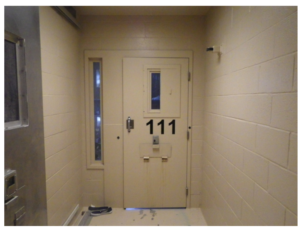
Exhibit 3.13 - Outside a Special Handling Unit (segregation) cell at Southeast Regional Correctional Center

3.134 We recommend the Department of Justice and Public Safety implement a formulary for medications for use within all provincial correctional institutions. Where possible the formulary should be aligned with drug protocols in Federal penitentiaries.