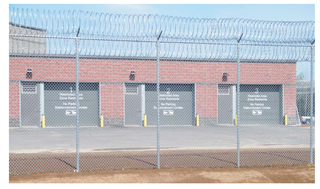
Exhibit 3.15 - Outside admissions entrance Southeast Regional Correctional Centre